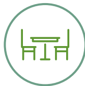
Shared Tenant Rooftop Terrace