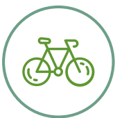
On-Site Bike Storage