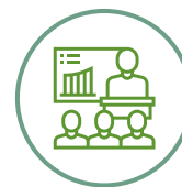
Common Conference Rooms