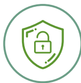
24-Hour Security & Concierge