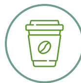
Coffee Cart in Annex Building