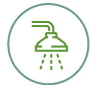
Shower and Locker Facilities