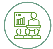
Common Conference Rooms