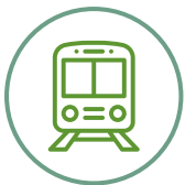
Adjacent to Light Rail Station